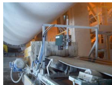
Exit of the drum drier.